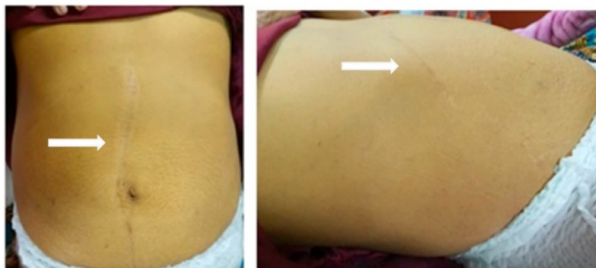
Fig. 1. Jaundice and surgery scar on inspection of the abdomen (white arrows).